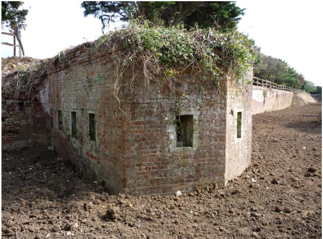
A caponier and section of the Carnot wall in September 2008