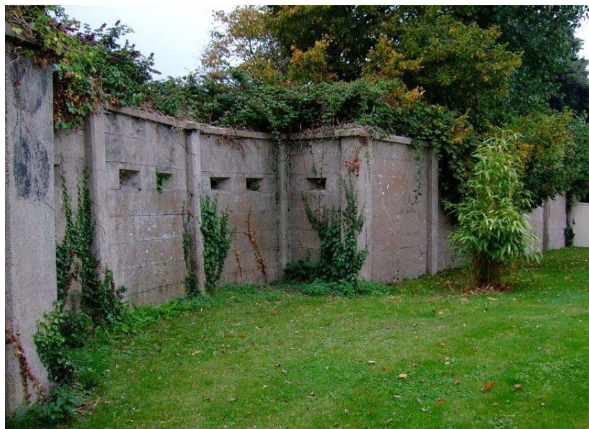
The ferro-concrete wall