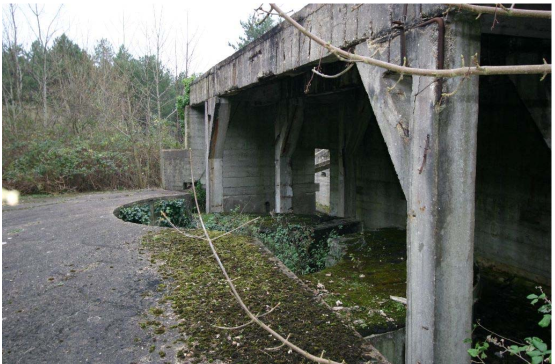
A gun emplacement in 2007